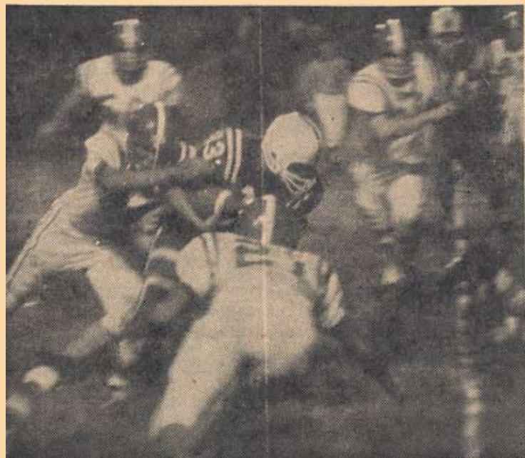
EAGLE PLAYER plows through Norte Vista defense.