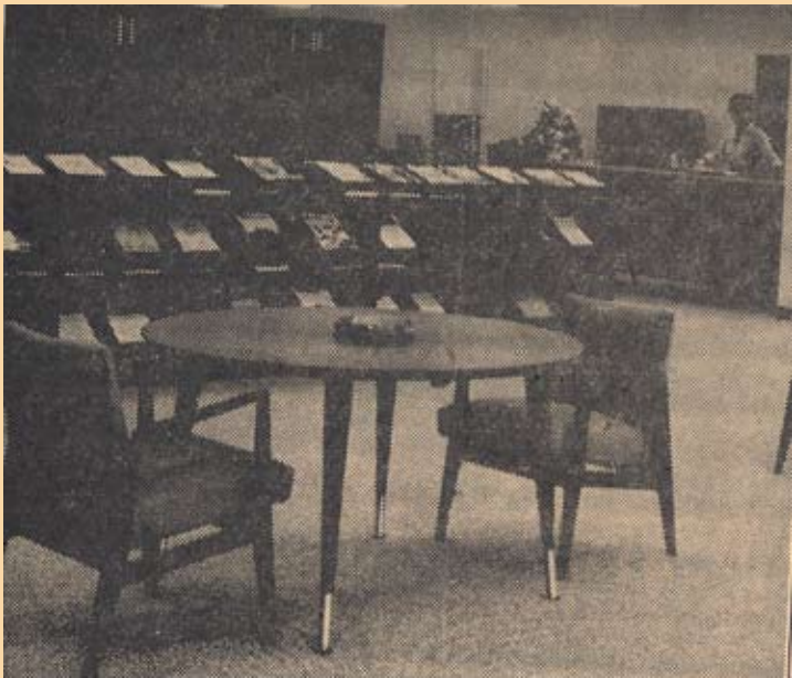
ABOVE PHOTO shows the overall view of the Technical Library at Aerospace Corporation, 1111 E. Mill Street, San Bernardino.